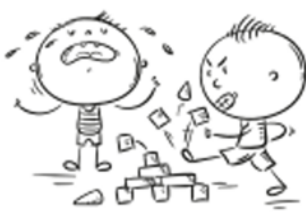
I was unkind