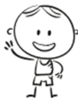
Use kind words