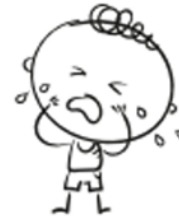
I hurt someone

Which of the school rules did you not follow?