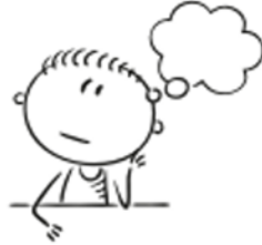
I was not working hard