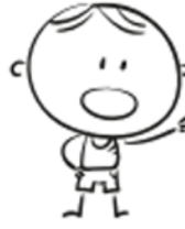
I was talking