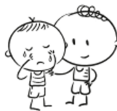
Be kind to others